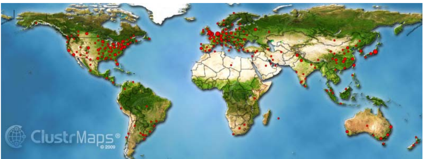
Geographical distribution of the www.brassica.info visitors (4 Jan 2010)